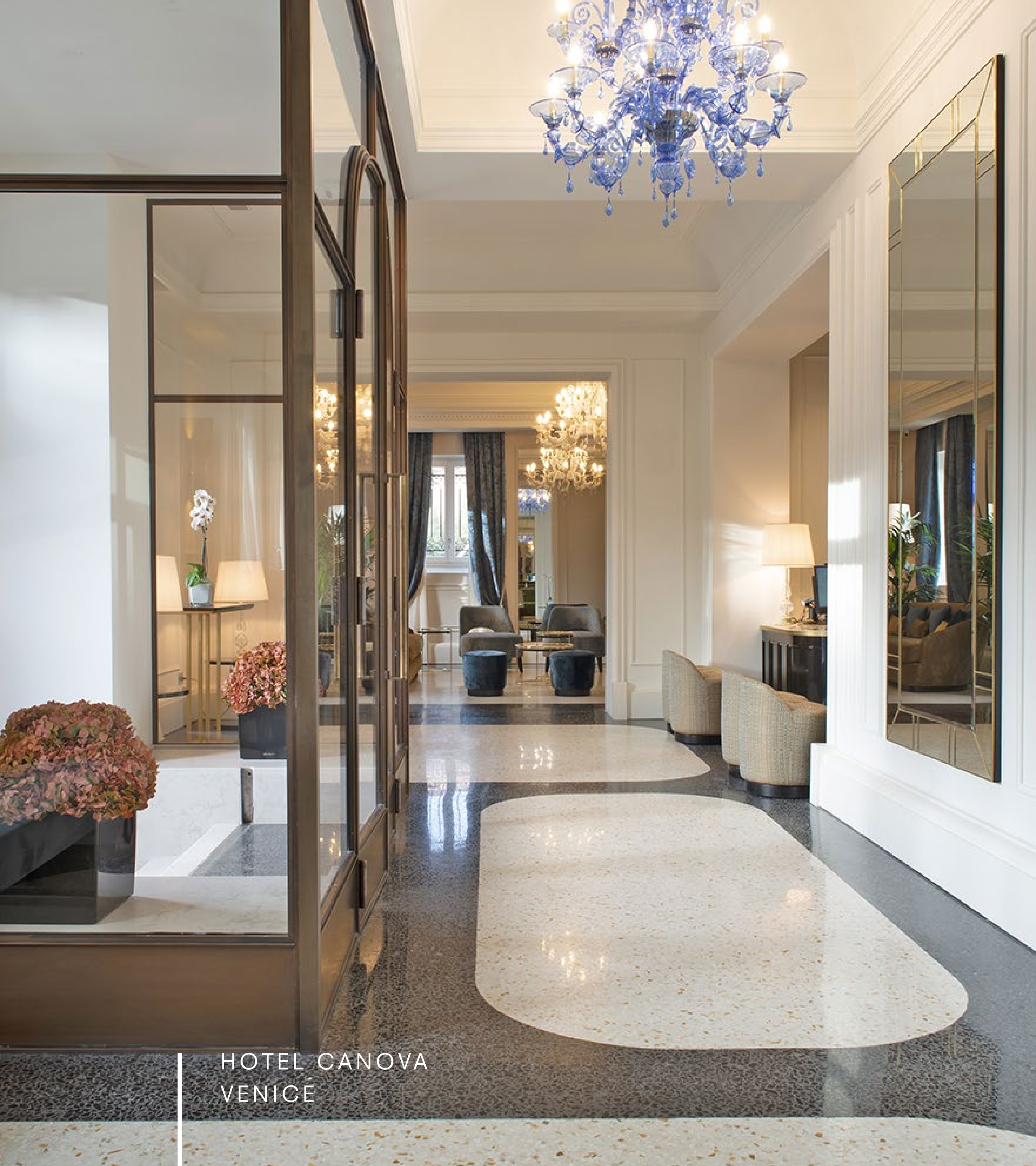
HOTEL CANOVA VENICE